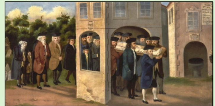
9 The Entrance of the Burial Procession into the Cemetery Prague ca 1772, oil on canvas 55 x 110 cm, Inv no 12.843/8

It is customary to stop seven times on the way to the grave, each stop causing the individuals in the procession to reflect on death and its teaching on how to live.