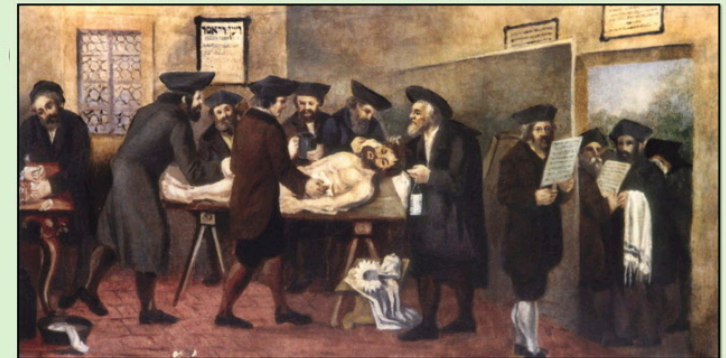
8 Washing of the Body Prague ca 1772, oil on canvas, 55 x 110 cm, Inv no 12.843/5

The body of the deceased is washed with reverence as the liturgy is recited in preparation for the taharah (purification through pouring water over the body). The Vaya'an Vayomer prayer is visible on the wall, reminding the Chevrah Kadisha to show the meit (deceased) the same dignity that God's angels showed to Joshua in preparing him to be Kohen Gadol (High Priest).