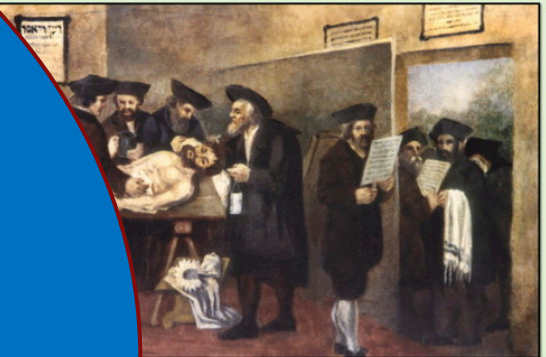
6 Washing of the Body Prague ca 1772, oil on canvas, 55 x 110 cm, Inv no 12.843/5

as the Chevrah Kadisha to show the meit (deceased) the same dignity that God's angels showed to Joshua in preparing him to be Kohen Gadol (High Priest). The washing