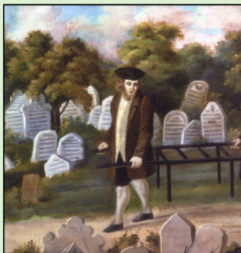
5 Making the Coffin Prague ca 1772, oil on canvas, 55 x 110 cm, Inv no 12.843/8

The aron (coffin) was (and still is), by tradition, very simple, to demonstrate the equality of all persons in death. The depiction of this task in the series of paintings