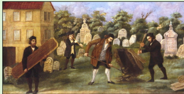
6 Digging the Grave Prague ca 1772, oil on canvas, 55 x 110 cm, Inv no 12.843/7

According to halachah (Jewish law), a grave must be dug at least two cubits deep (a cubit being a measure of the forearm from the tip of the middle finger to the bottom of the elbow).