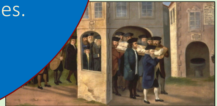
7 Funeral Procession into the Cemetery Prague ca 1772, oil on canvas, 55 x 110 cm, Inv no 12.843/8

It is customary to stop seven times on the way to the grave, each stop causing the individuals in the procession to reflect on death and its teaching on how to live.