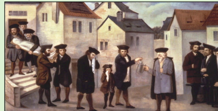
7 Carrying out the Body Prague ca 1772, oil on canvas, 55 x 110 cm, Inv no 12.843/6

The body of the deceased is taken to the cemetery. The tzedakah (charity) box is a central feature in the painting, showing the value of giving charity in honor of the one who has died. As in several other pictures, there is weeping.