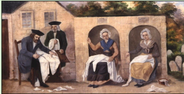
4 Making the Shroud Prague ca 1772, oil on canvas, 55 x 110 cm, Inv no 12.843/4

The number and type of tachrichim (burial garments) vary from place to place. They are meant to be like the garments worn by the High Priest on Yom Kippur in the Temple in Jerusalem, for the one who died needs to be adorned in such a way as to be prepared to meet the Holy One.