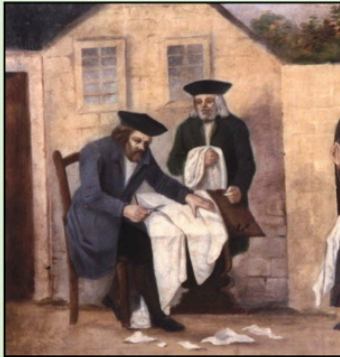
4 Making the Shroud Prague ca 1772, oil on canvas, 55 x 110 cm, Inv no 12.843/5

The number and type of tachrichim (burial garments) vary from place to place. They are meant to be like the garments worn by the High Priest on Yom Kippur in the Temple in Jerusalem, for the one who died needs to be