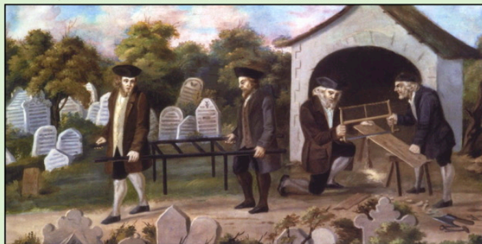
5 Making the Coffin Prague ca 1772, oil on canvas, 55 x 110 cm, Inv no 12.843/11

The aron (coffin) was (and still is), by tradition, very simple, to demonstrate the equality of all persons in death. The depiction of this task in the series of paintings suggests that each coffin was made for the given individual.